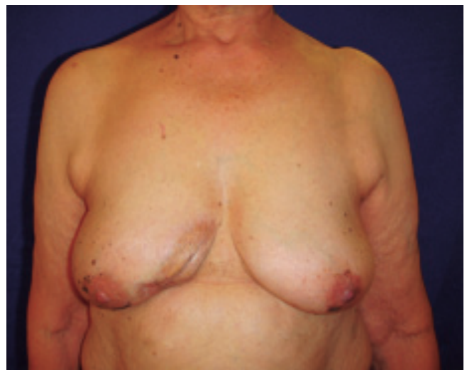
Figure 3. Resolution after chemotherapy.