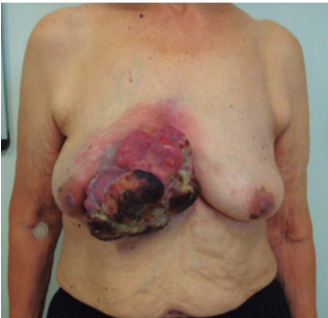
Figure 1. Large mass involving the entire right breast.